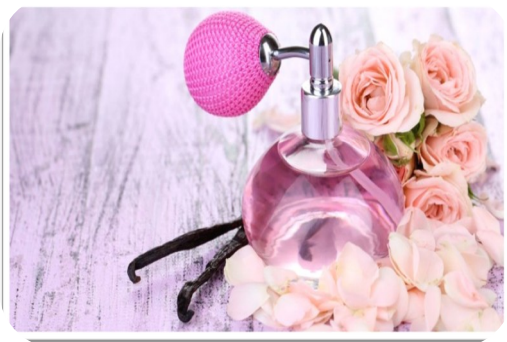
Fine Fragrances and Misc Perfumes