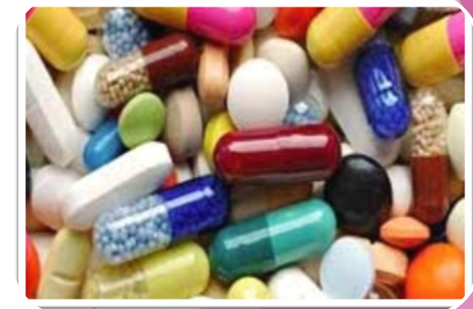
Pharmaceuticals and Lip Balms