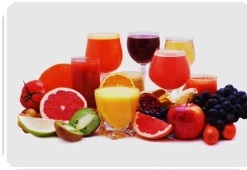
Beverage and Dairy Products