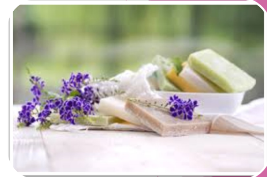
Cosmetics and Toiletries