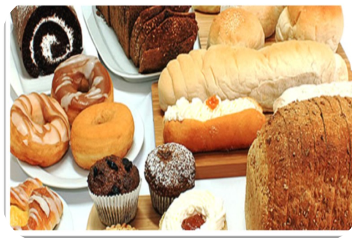
Baking and Confectionery ; Chewing Gum and Chocolate ; Ice Creams and Jams